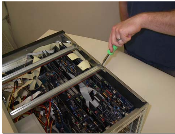
Figure 1.1: Removing the Retaining Bar